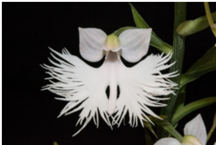
Habenaria Pegasus 'Bryon' AM/AOS; Photographer: Bryon Rinke

And... Here's a link to check it all out - http://www.aos.org/