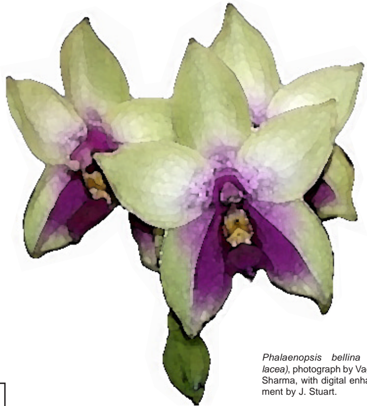
Phalaenopsis bellina (violetacea)

DON'T FORGET TO BRING YOUR BLOOMING ORCHIDS FOR THE MONTHLY SHOW TABLE!!!