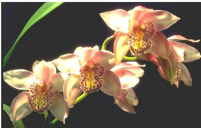
CYM. NANCY'S TREASURE 'PRECIOUS'